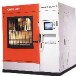
EDM Wire-cutting Duration : 4 weeks