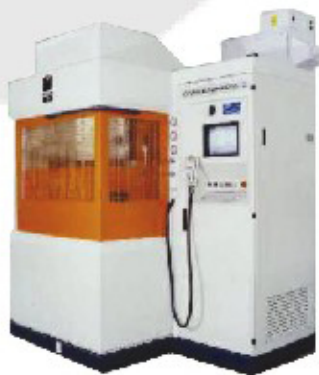
EDM Die-sinking Duration : 4 weeks